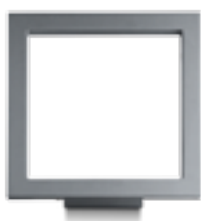
Range extension Trim double emission